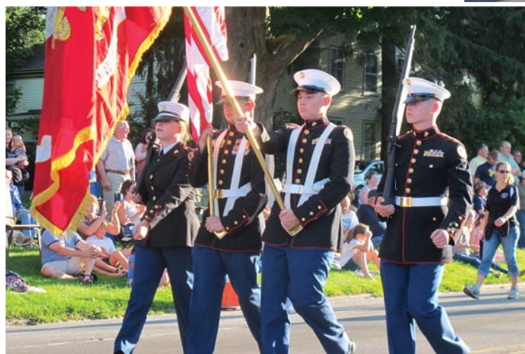
MACS Marine Corps JROTC