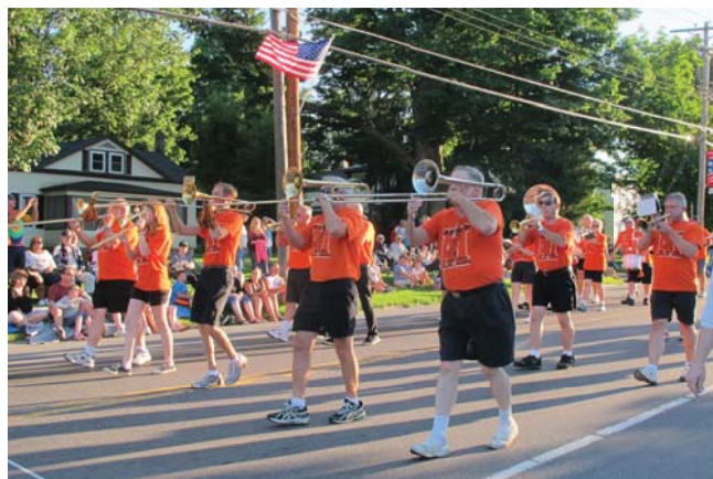
MACS Matador Alumni Marching Band