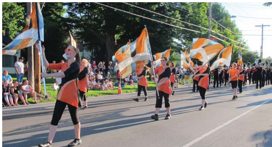
MACS Color Guard