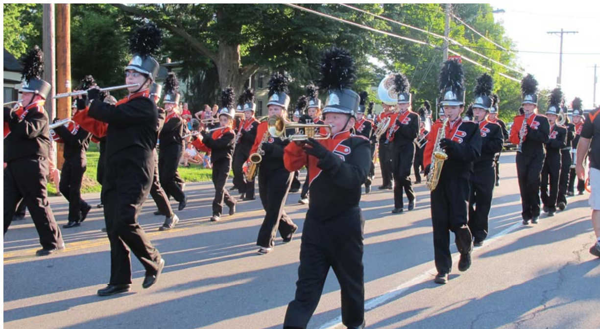
MACS High School and Middle School Marching Bands (combined)

In addition to the Mexico Firemen's Field Day Parade, MACS Marching Bands and MACS Color Guard participated in three other parades with the firemen of Mexico and New Haven including: Oswego County Fair Parade, Pulaski Firemen's Field Day Parade, and Hannibal Firemen's Field Day Parade. The students that marched were rewarded with a trip to the Enchanted Forest in Old Forge, NY on August 15.